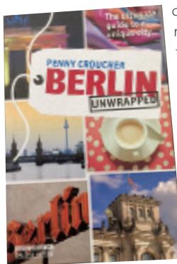
Clockwise from top left: Clärchens Ballhaus; Penny Croucher; the Pierre Boulez Saal; Penny Croucher's book, Berlin Unwrapped ; Crackers Bar & Restaurant.

the forest and take the ferry across to Pfaueninsel (Peacock Island). Or I head east to Köpenick, stroll around the palace grounds, then take a boat across the Müggelsee. But best of all, I like to cycle to Grunewald, swim in a lake, and visit friends who have a wooden house in a garden colony there. W